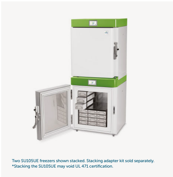
Two SU105UE freezers shown stacked. Stacking adapter kit sold separately. *Stacking the SU105UE may void UL 471 certification.