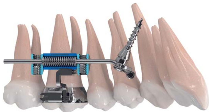
amda® system, assembled.