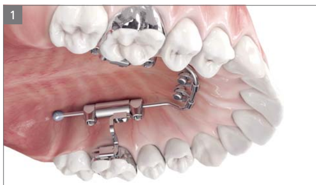
Skeletal anchorage of amda ® using two tomas ® -pin EP.