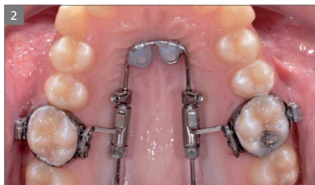
amda ® in situ.

The tomas ® system has been one of the leading skeletal anchorage systems worldwide for many years. Users value its easy handling and high reliability. Be it distalization, mesialization, intrusion, palatal expansion or indirect anchorage: tomas ® offers a complete system for these indications. It has something to offer both the beginner and the professional in skeletal anchorage systems.